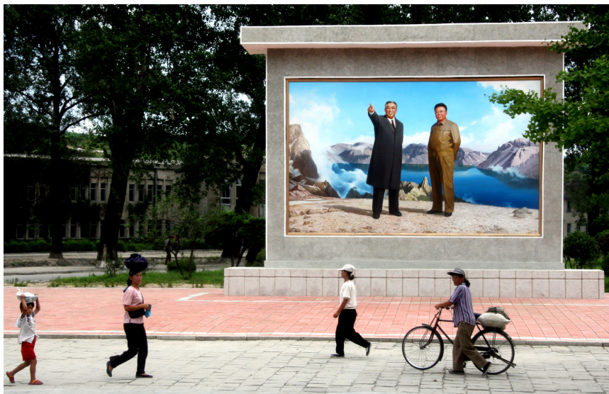
North Koreans pass by a mural of Kim Il Sung (left) and Kim Jong Il (right).

Kim also created a mythology around himself that some experts have likened to a religious cult. North Korea's government told its people that Korea was a chosen land and the site where civilization originated. Images of Kim—known to his people as “The Great Leader”—hung in every shop, home, and subway car. Everything that Kim said became law. No dissent or criticism was permitted. One could be imprisoned for simply sitting on a piece of newspaper with a photo of