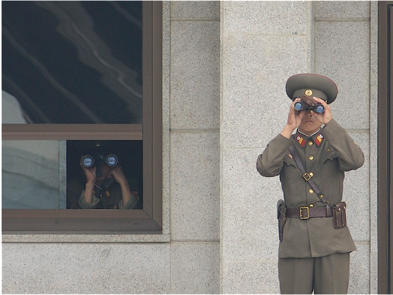
North Korean soldiers look south across the DMZ.

South Korea's President Kim Dae Jung for his policies. In 2000 he was awarded the Nobel Peace Prize. But critics argued that the sunshine policy was helping to prop up a hostile, oppressive regime in North Korea.